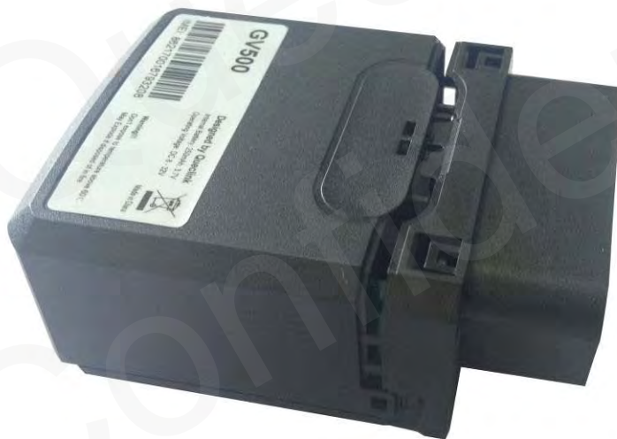
Figure 3. Opening the Case