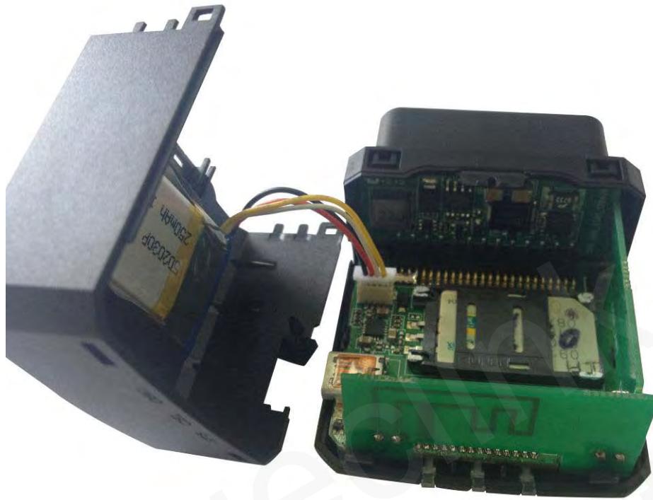
Figure 6. Backup Battery Installation

There is an internal backup Li-ion battery.