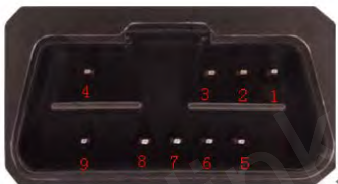
Figure 2. The OBD II connector on the GV500

The GV500 has an OBD II connector. It contains power supply and interfaces of CAN bus, K-line, L-line and J1850 bus. The sequence and definition of the OBD II connector are shown in following figure: