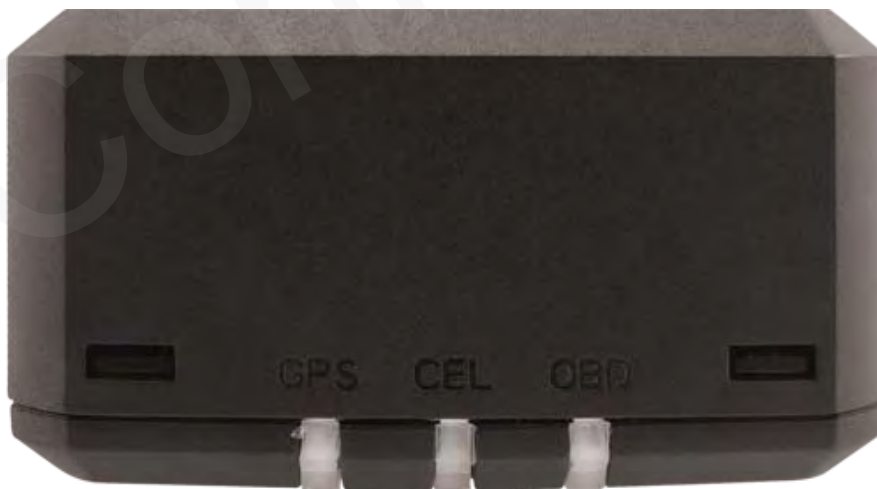
Figure 7. GV500 LED on the Case