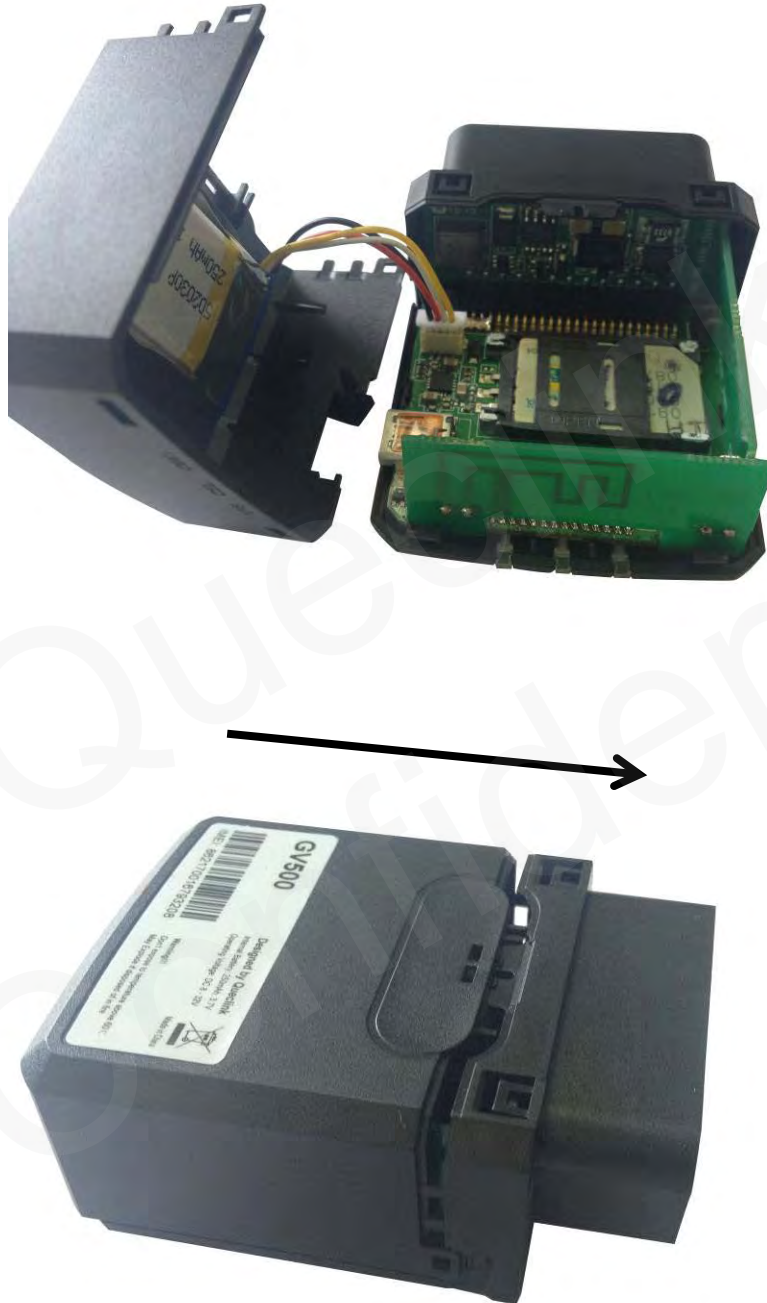
Figure 4. Closing the Case

The battery is glued to top cover, so before closing the case you should let the battery connector plugged in. The step of closing case is shown as following: