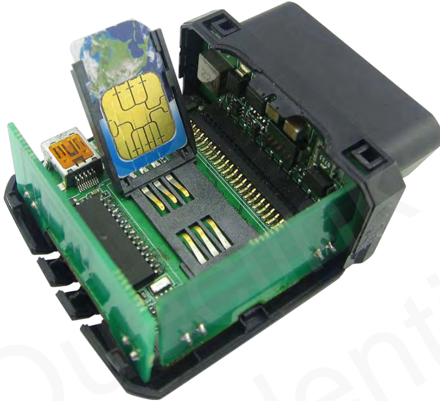
Figure 5. SIM Card Installation

Open the case and ensure the unit is not powered. Slide the holder right to open the SIM card. Insert the SIM card into the holder as shown below with the gold-colored contact area facing down taking care to align the cut mark. Close the SIM card holder. Close the case.