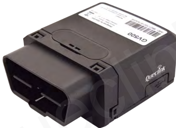
Figure 1. Appearance of GV500

GV500 is based on the OBD II interface GPS vehicle tracking device, compact design and easy to install. GV500 contains an OBD II connector which complies with J1962 standard, a 10PIN USB connector, an internal GSM antenna, an internal GPS antenna and three LEDs.