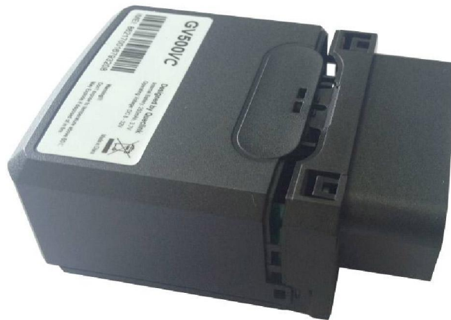
Figure 3. Opening the Case