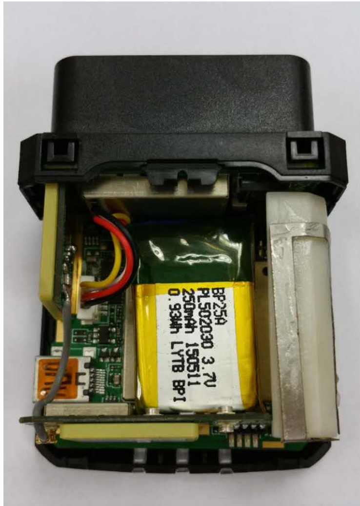
Figure 5. Backup Battery Installation

There is an internal backup Li-ion battery.