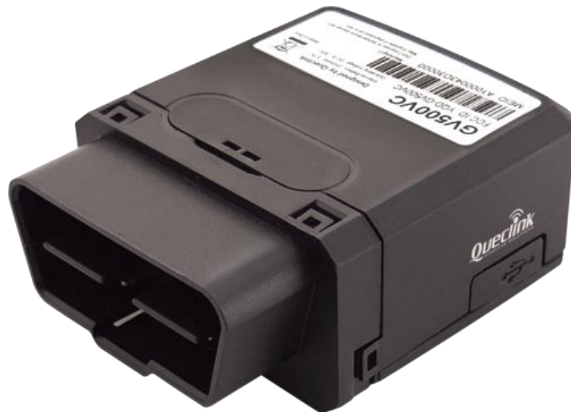
Figure 1. Appearance of GV500VC

GV500VC is based on the OBD II interface GPS vehicle tracking device, compact design and easy to install. GV500VC contains an OBD II connector which complies with J1962 standard, a 10PIN USB connector, an internal CDMA antenna, two internal GPS antenna and three LEDs.