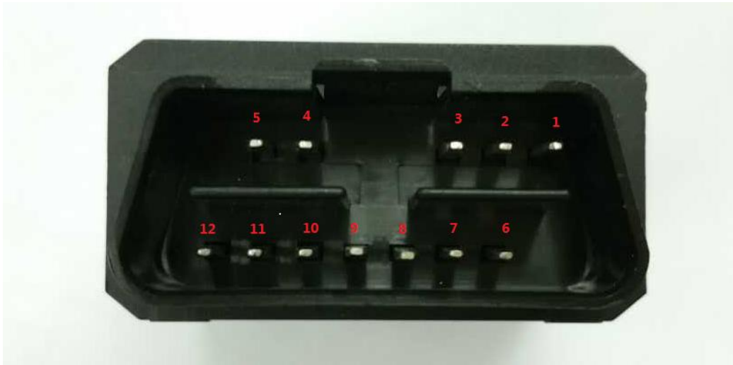
Figure 2. The OBD II connector on the GV500VC

The GV500VC has an OBD II connector. It contains power supply and interfaces of CAN BUS, K-line, L-line, J1850 BUS, GMLAN Single Wire CAN (GMW3089) and Ford Medium Speed CAN (MS CAN). The sequence and definition of the OBD II connector are shown in following figure: