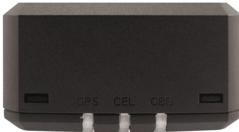
Figure 6. GV500VC LED on the Case