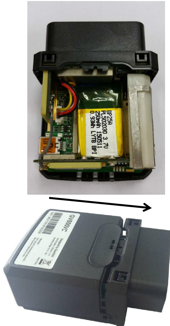
Figure 4. Closing the Case

The battery is glued to shield cover, so before closing the case you should let the battery connector plugged in. The step of closing case is shown as following: